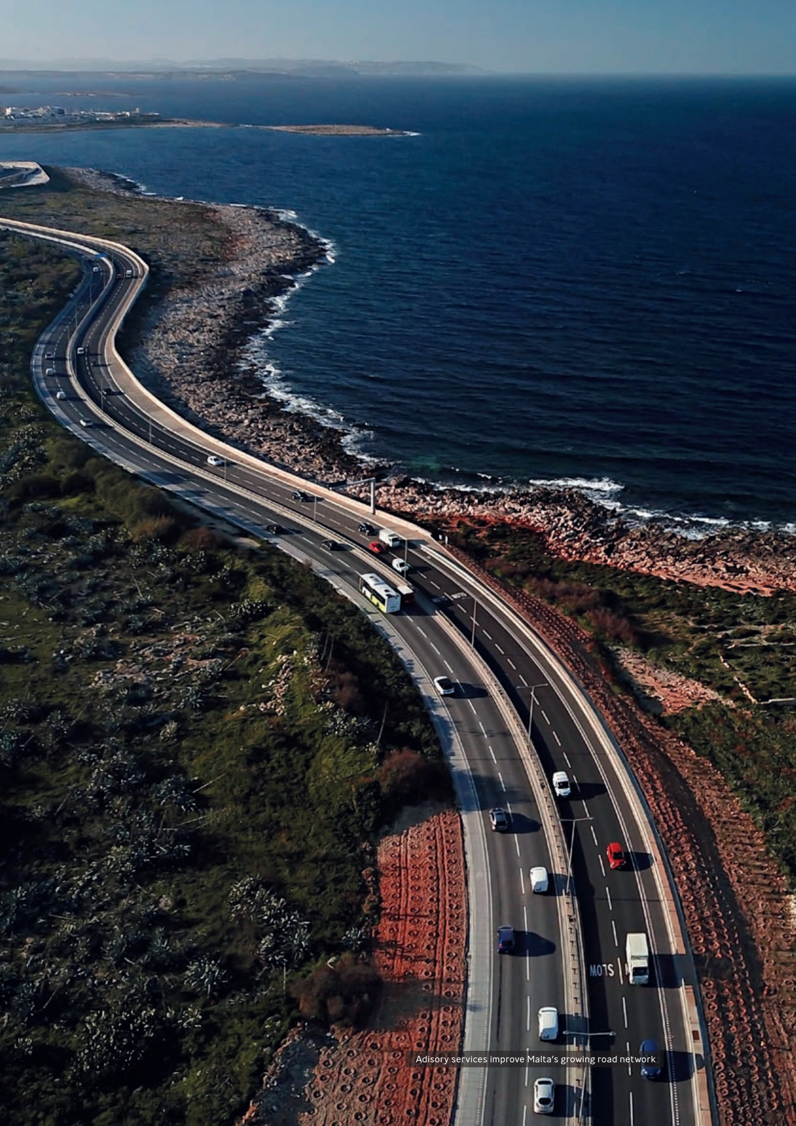
Adisory services improve Malta's growing road network