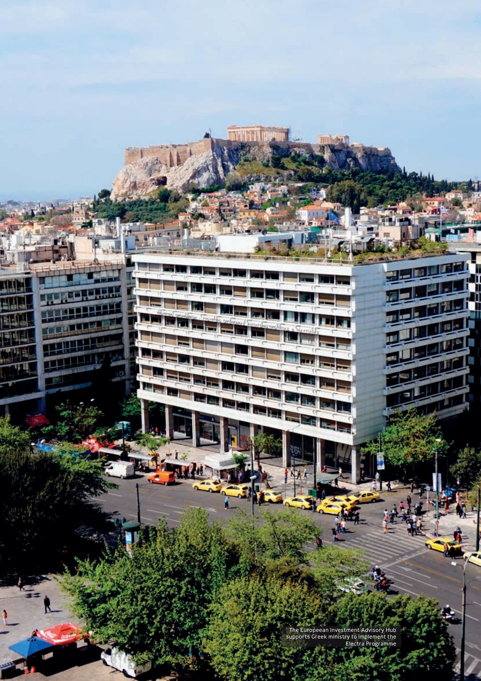
The European Investment Advisory Hub supports Greek ministry to implement the Electra Programme